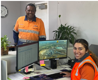
Pictured is Big Dave being prepared for site access.